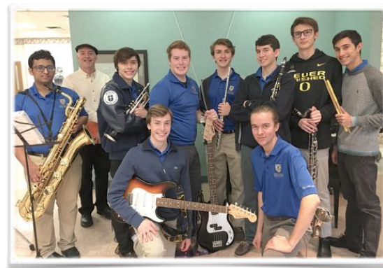
Jesuit College Preparatory School

A nursing home activity assistant made the following comment on her evaluation: "Our residents can't get out to see quality concerts. They really enjoyed seeing the kids perform."