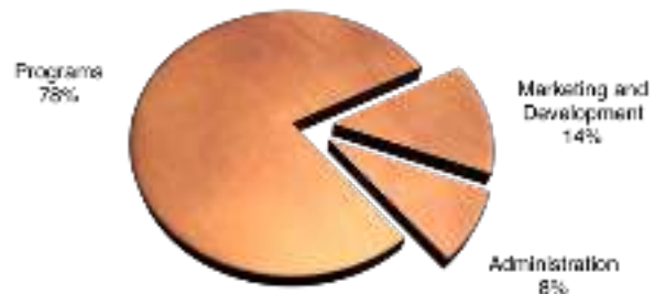
Expenses by Percent