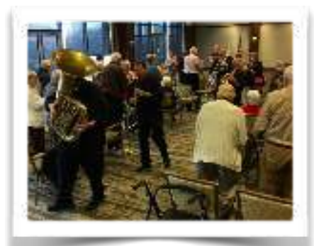
Trinity River Dixie Kings

Our Concerts for Seniors series introduced 18 locations throughout the county to the quality of Texas Winds musicianship, and saw a 25% increase in donations from facilities receiving programs. A new partnership was formed with the North Texas Chapter of the Alzheimer's Association and pilot programs were performed at two Texas Oncology clinic locations.