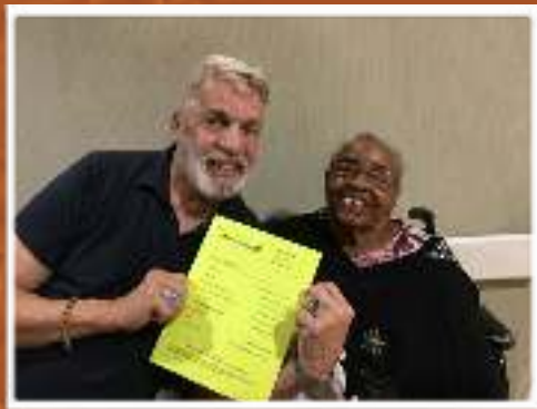
Audience members at Walnut Place

Texas Winds Musical Outreach engages, comforts and celebrates the spirits of isolated seniors, hospital patients, veterans and children in North Texas through live, professional musical performances.